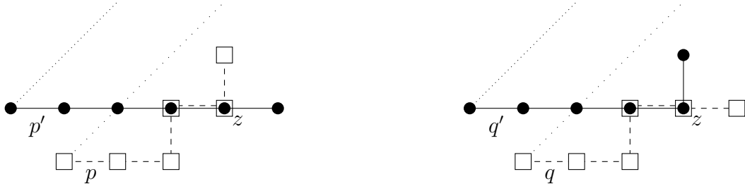
Figure 2: The main step in the lattice path proof of Theorem 3.2

Theorem 3.2. For any fixed n , the sequences